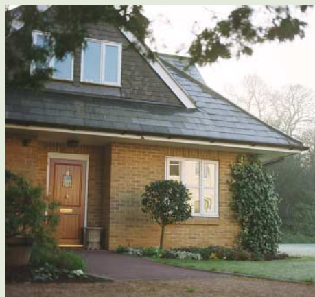
A Willicombe Park bungalow