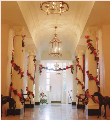
Christmas decorations at Willicombe Park

Residents enjoyed a full programme of events to celebrate Christmas, including a residents' cocktail party and a Christmas carol and music evening.