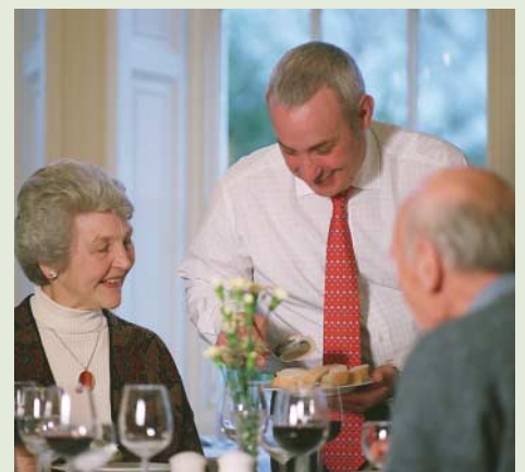
Dining at Hollins Hall