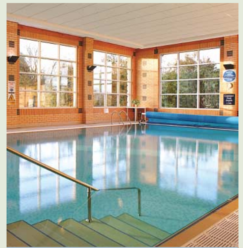
The swimming pool at Hollins Hall

The Raven Audley Court ethos is "gracious, independent living" and the new company plans to develop many further projects over the next few years.