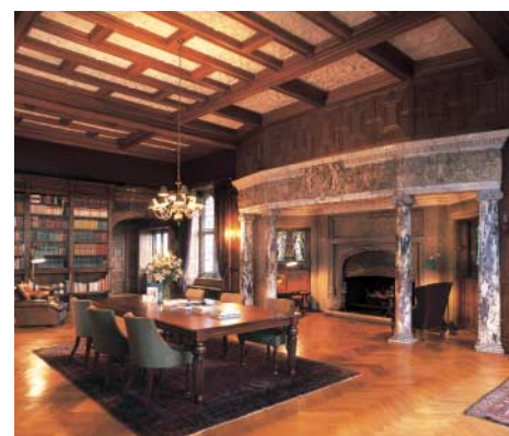
The library at Flete House

We are very pleased that some of the those already living there have chosen to stay and are buying the flats they previously rented. They will continue to have all their meals in Flete's beautiful dining room. We have started offering for sale the renovated apartments. We hope Flete House will soon be alive again, giving people who love the South Devon countryside and coast an opportunity to live in glorious surroundings in a historic house, without having to worry about its maintenance.