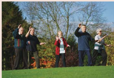
Tai Chi classes at Hollins Hall

We had our Christmas cocktail party early in December this year, as so many residents wanted dates in the dining room for their private celebrations with their families and friends. Just before Christmas, we had a much-enjoyed festive coffee morning with visits both from the children of Hampsthwaite Church Choir who sang carols to us, and from Father Christmas.