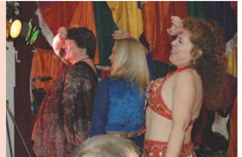
▶ Whitehawk belly dancers performing at the local Winter Pride Cabaret

Our Gateway team is on hand to give you information and support. If you're looking for a job or would like benefit or tax advice, we can help with that too. Just pop in or call us on 01273 682222.