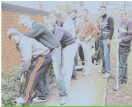
▶ Legal & General help out in Saunders Park

EdF Energy also took part in a community challenge at the Women's Refuge project when 22 volunteers painted the whole premises over two days.