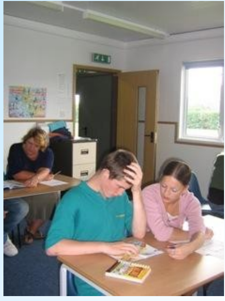
Emphasis is placed on learners attaining academic targets however small, and each day the timetable allows for reading time which enhances these skills.